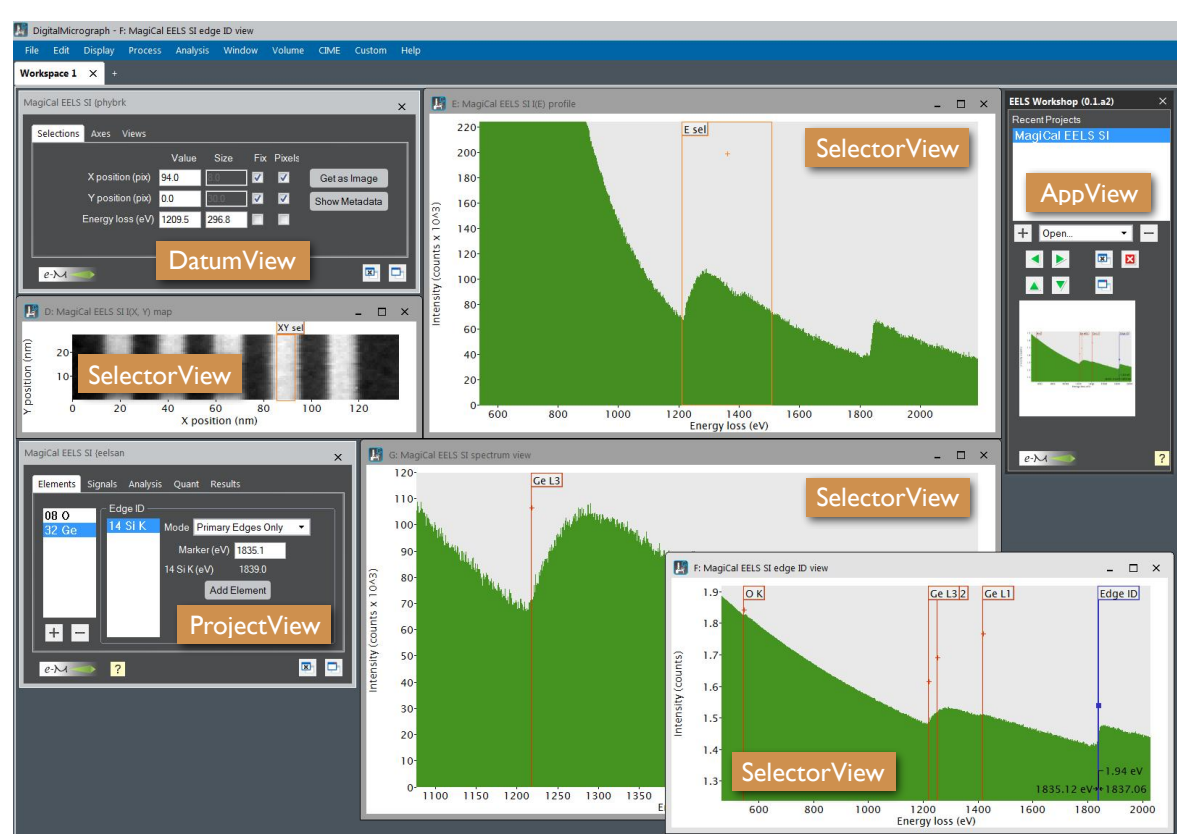
Figure 2. Snapshot of an active EELS spectrum image data set analysis using EELS Workshop, a typical realization of Enabler's Workshop App design pattern. All view and ROI actions are conveyed to the project via the underlying network of controller objects depicted in the class diagram.

Figure 1. Schematic UML class diagram of the Workshop App design pattern developed for the Enabler framework. Solid arrows represent parent-child instantiation relationships. Dotted arrows reflect back-communication pathways that can be used to keep all software modules apprised of analysis project status and analyst-triggered updates.